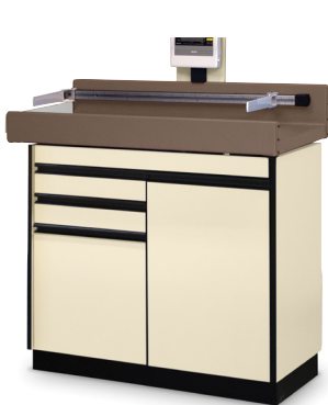
A. MODEL 4945