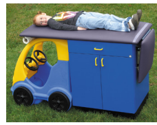
Legrest elevates up to 90° and extends top to 70"L.