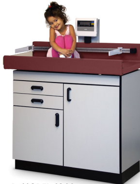
B. MODEL 4944