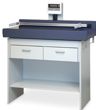
B. MODEL 4941