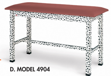
D. MODEL 4904