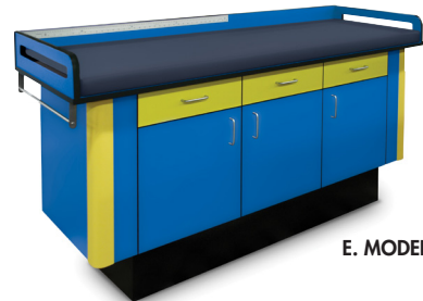
E. MODEL 4990