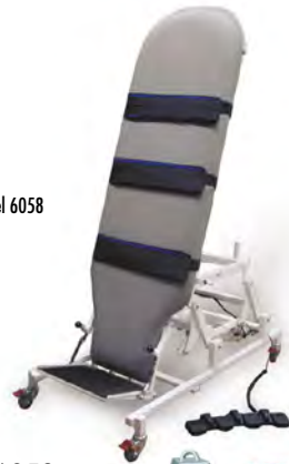
B. Model 6058