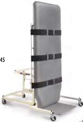
A. Model 6045