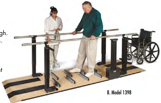
B. Model 1398