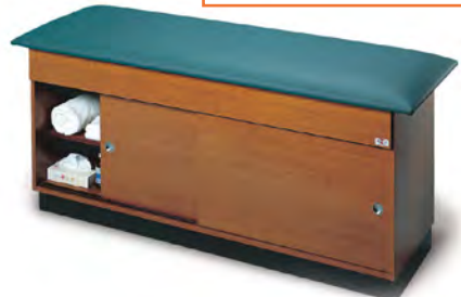
D. Model 4043