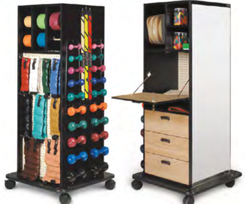
B. Model 5562-100