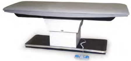
B. Model 4750