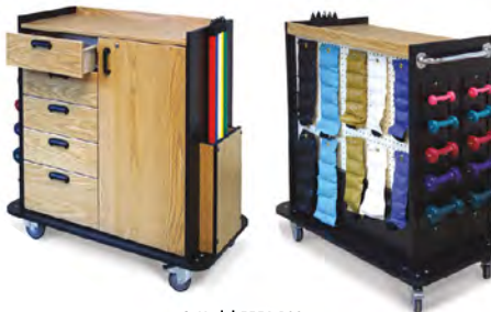
C. Model 5556-100