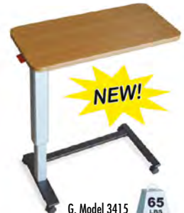
G. Model 3415