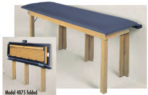
E. Model 4075