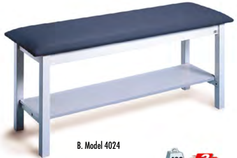
B. Model 4024