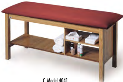
C. Model 4041