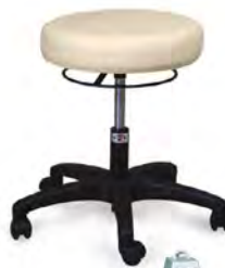
F. Model 2157