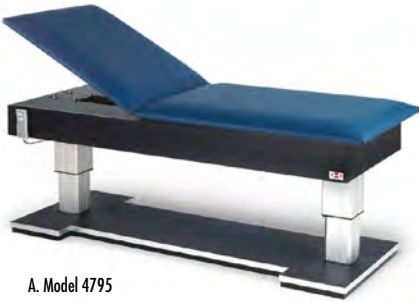
A. Model 4795