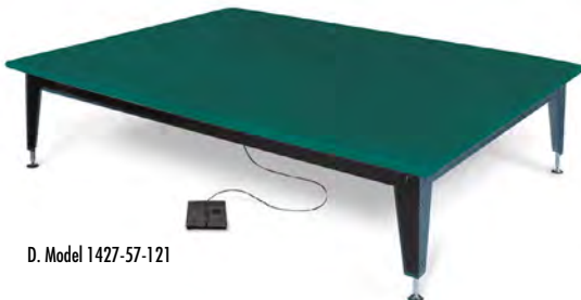
D. Model 1427-57-121