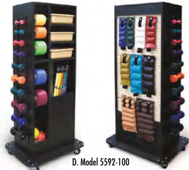
D. Model 5592-100