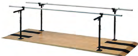
C. Model 1390