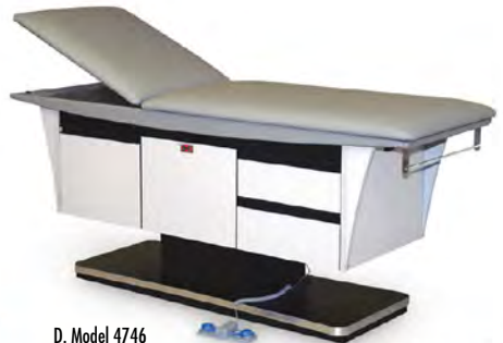
D. Model 4746