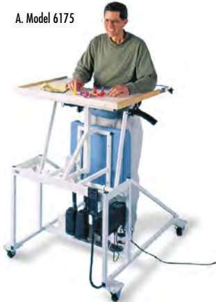
A. Model 6175