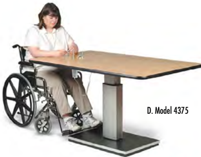
D. Model 4375