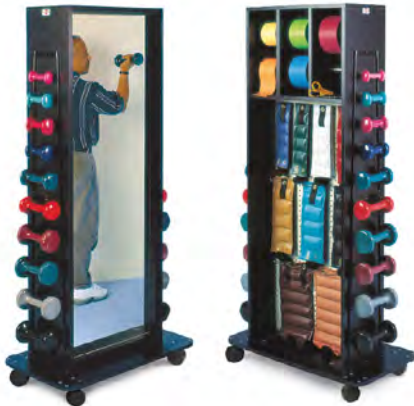
A. Model 5560-100