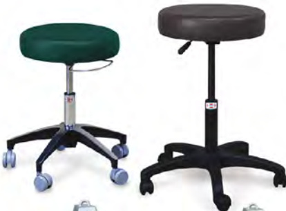
D. Model 2151