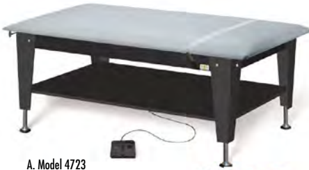
A. Model 4723