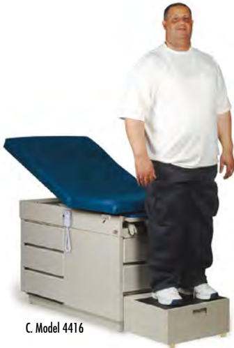
C. Model 4416