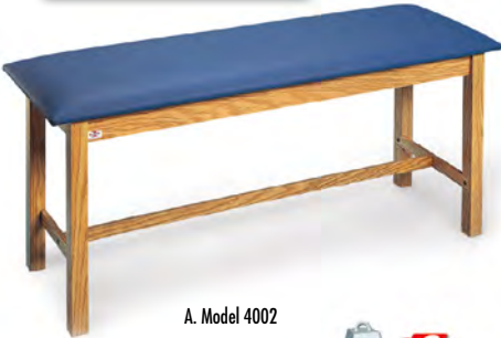
A. Model 4002