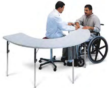
E. Model 6674