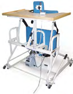
B. Model 6185