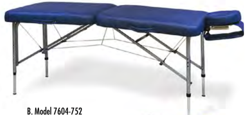
B. Model 7604-752