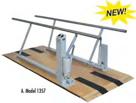
A. Model 1357