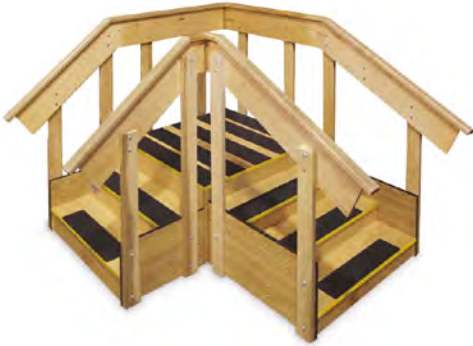
A. Model 1580