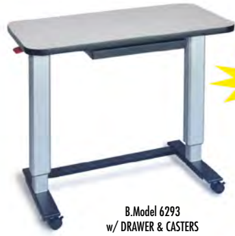
B. Model 6293 w/ DRAWER & CASTERS